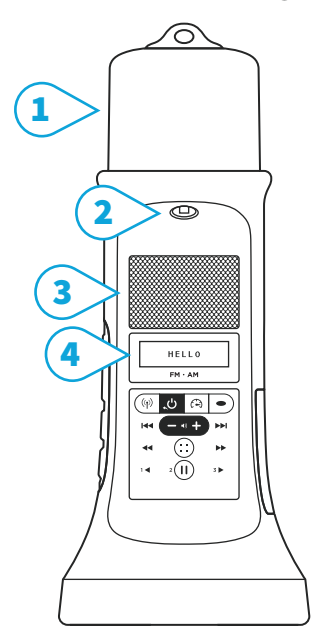
FRONT + BACK